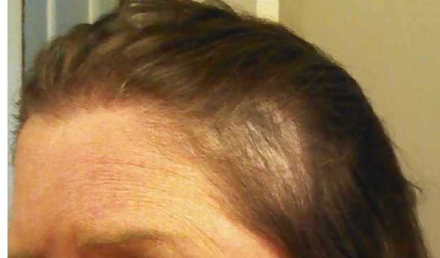
40. One or more of the Products' active ingredients act as a depilatory or caustic agent, either by causing a chemical reaction that damages the hair - 20 -