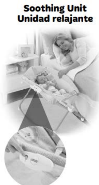
Above: Figure 11

130. This image is misleading because it implies that mothers can sleep when their babies are in the sleepers, while, at the same time, Defendants warn that babies should be supervised when in a Rock 'n Play Sleeper. Mothers cannot supervise their children when they are themselves sleeping.