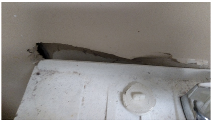
e. ... The entire top of the unit separated and flew across the room exploding that [sic] glass across the laundry room and into our hallway, and the explosion put holes in the wall, damaged shelves, etc. If my wife or son were in the room when this happened, I have no doubt that they would be in the hospital or possibly even killed. (Report date: November 18, 2015; Model No.: WA50F9A6DSW/A2; Photographs Below)